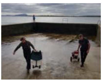
The Belmullet Tidal Pool has been part of the community's cultural and social heritage for over 40 years. Over time, algae build up that need to be removed, so our dedicated group of volunteers keep busy scrubbing and cleaning.