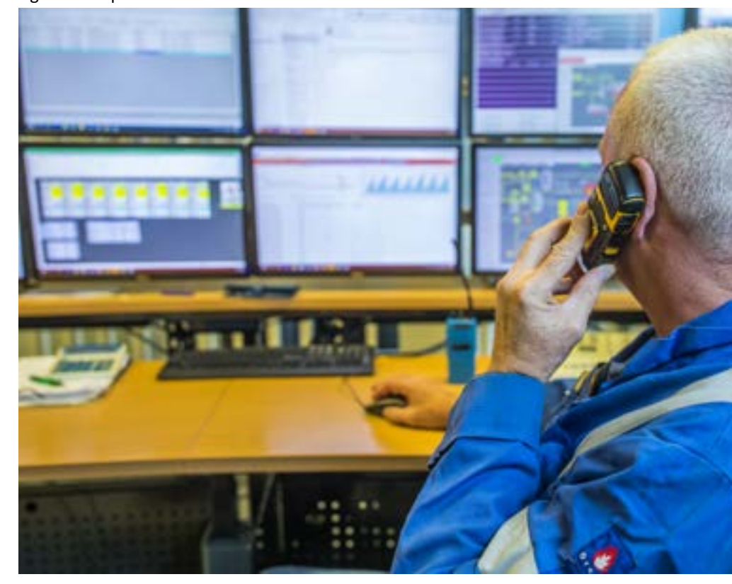
Technology use is already driving significant operational efficiencies.

We anticipate that our plan will be complete in 2024, and that it will constitute a living document - one that will be updated as economic, technological and regulatory landscapes evolve.