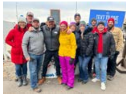
We supported Food for Thought, an organization that works to eliminate childhood hunger, with volunteers helping assemble PowerSacks that contain two meals of non-perishable food to feed a family of four over the weekend.