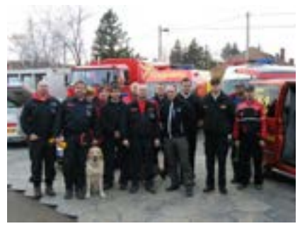
We helped the Hungarian Food Bank Association, located in Budapest, with a food drive to purchase food supplies and prepare lunch for 120 people who are experiencing homelessness and poverty.