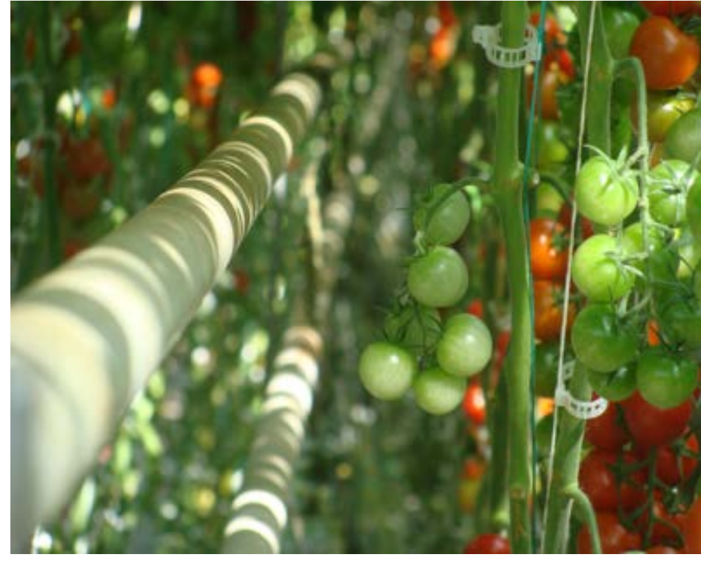
Geothermal heat from the produced water at our oil operations in Parentis supports the production of more than 7,500 tonnes of tomatoes annually in 15 hectares of greenhouses

additional information, including where in the value chain these risks and opportunities occur.